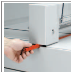
EASY CUTTING STICK CHANGE