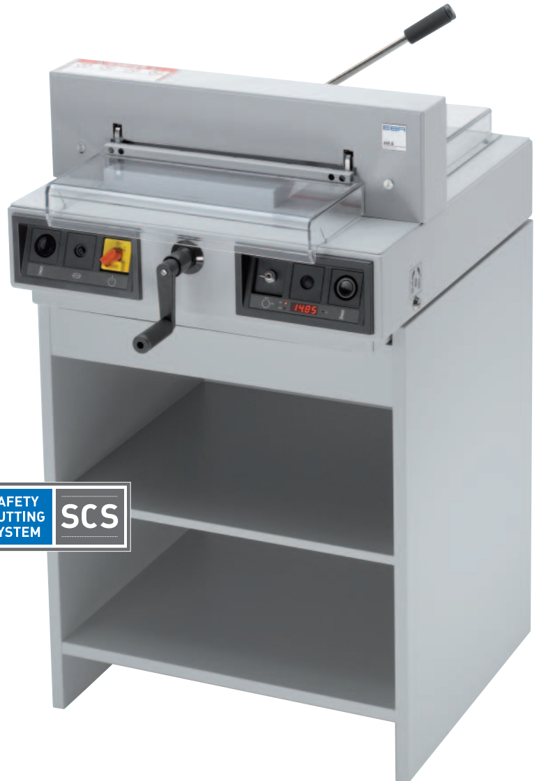
EBA 435 E with optional cabinet